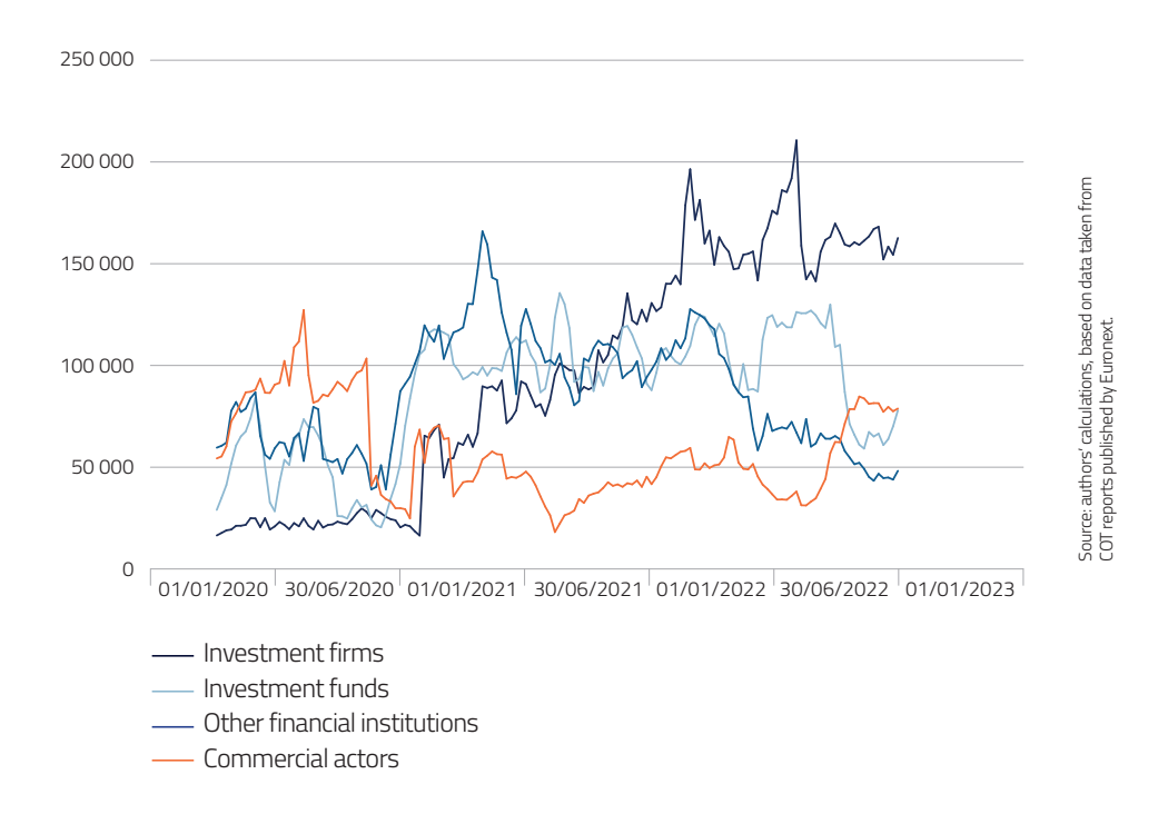
Evolution of speculative buying positions on Matif wheat prices by type of actor (in absolute numbers)